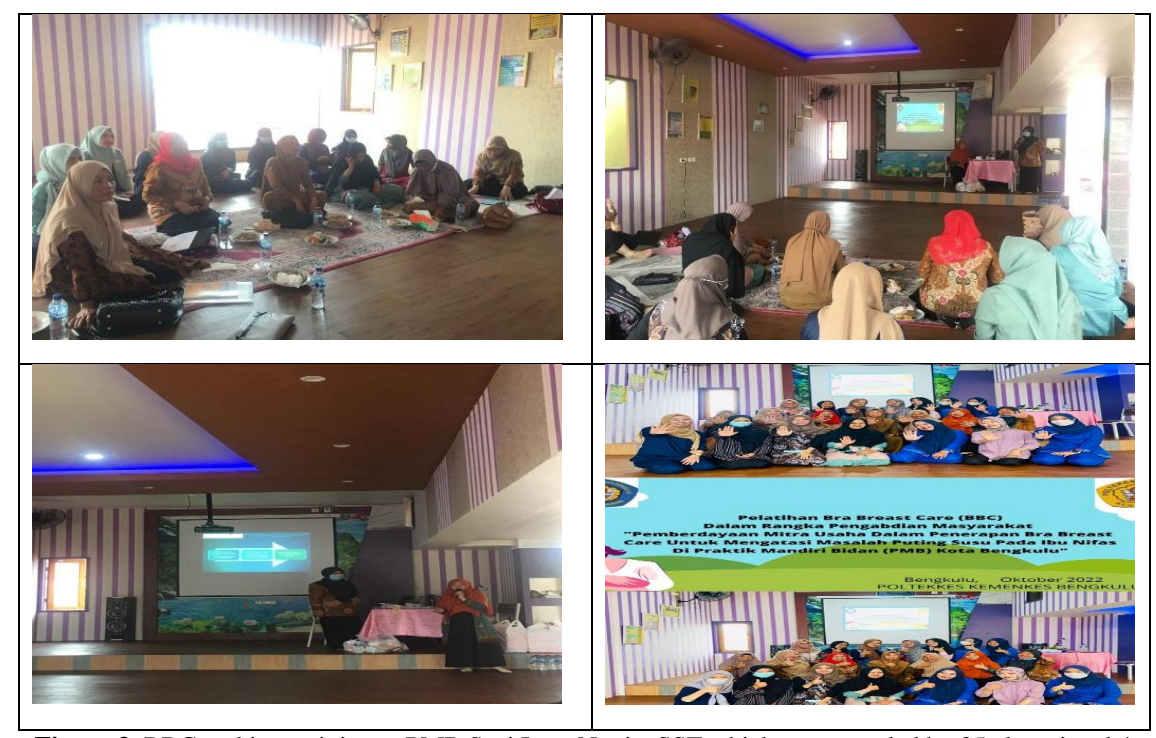
Figure 3 . BBC making training at PMB Susi Irma Novia, SST which was attended by 25 alumni and 4 community service team members